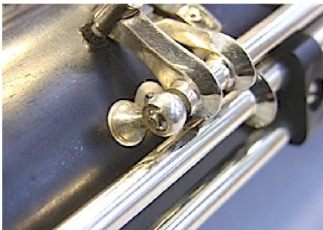
Ball Bearing System on bass clarinet