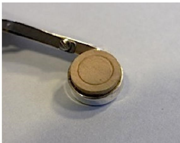
Finely Polished Cork Pads

The upper joint is fitted with a combination of very fine pore-free and quartz-polished aged cork pads and double-sealed white leather pads. This improves durability, precision, seal and response. The lower joint is also fitted with double-sealed white leather pads, ensuring no pad "buzz." These pads are impervious to moisture and our pad-fitting technique eliminates the chance of them falling out.